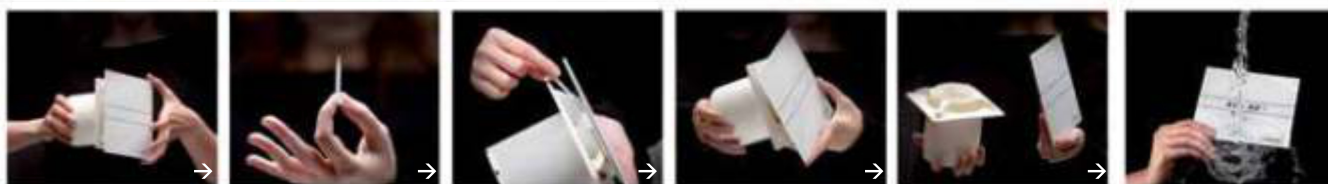
E-100 GLASS LIGHT

Infra red sensor activated by presence and adjustable electronic timer from 40 seconds to 15 minutes.