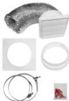
GLASS KIT & RING FIXTURE