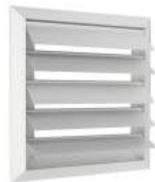
GRILL ON PRESSURE