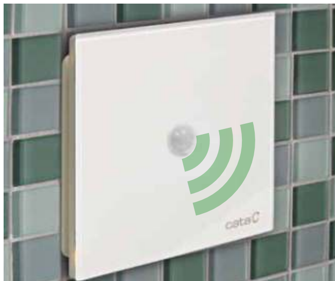
E-100 GLASS PIR - Infra red sensor, activated by presence